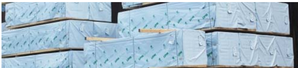
Stacked Timber packages