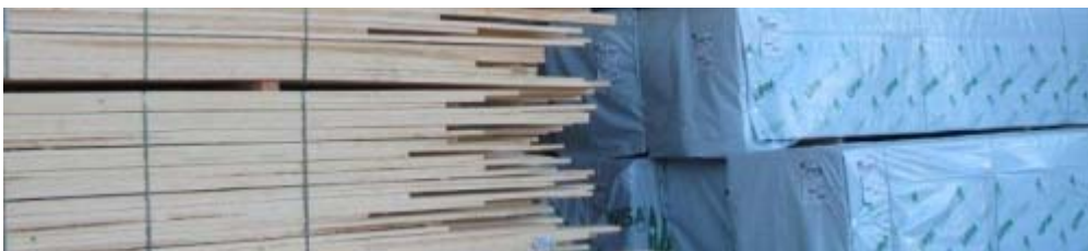
Timber length and truck packages

The purpose of packaging is to protect the product against mechanical wear, tear, moisture and dirt. Sawn goods are packed either in length-or truck packages.